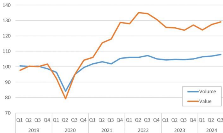
Chart 1: World merchandise trade volume and value, 2019Q1 - 2024Q3 (Indices, 2019 = 100)

Note: World trade refers to average of world exports and imports.